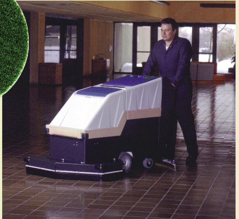
Use Ruff® when cleaning grouted tile floors instead of expensive brushes.

Ruff® is made of porous materials that allow liquids to pass through to the surface for use with autoscrubbers.