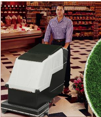
Use Ruff® to clean non-slip tile floors with the ease of a light flexible floor pad.

ETC's Ruff® Pad is unbeatable for auto-scrubbing and disk scrubbing of abrasive floors, grouted tile floors, terrazzo, poured non-slip floors, concrete floors and other uneven floors that would normally require a brush.